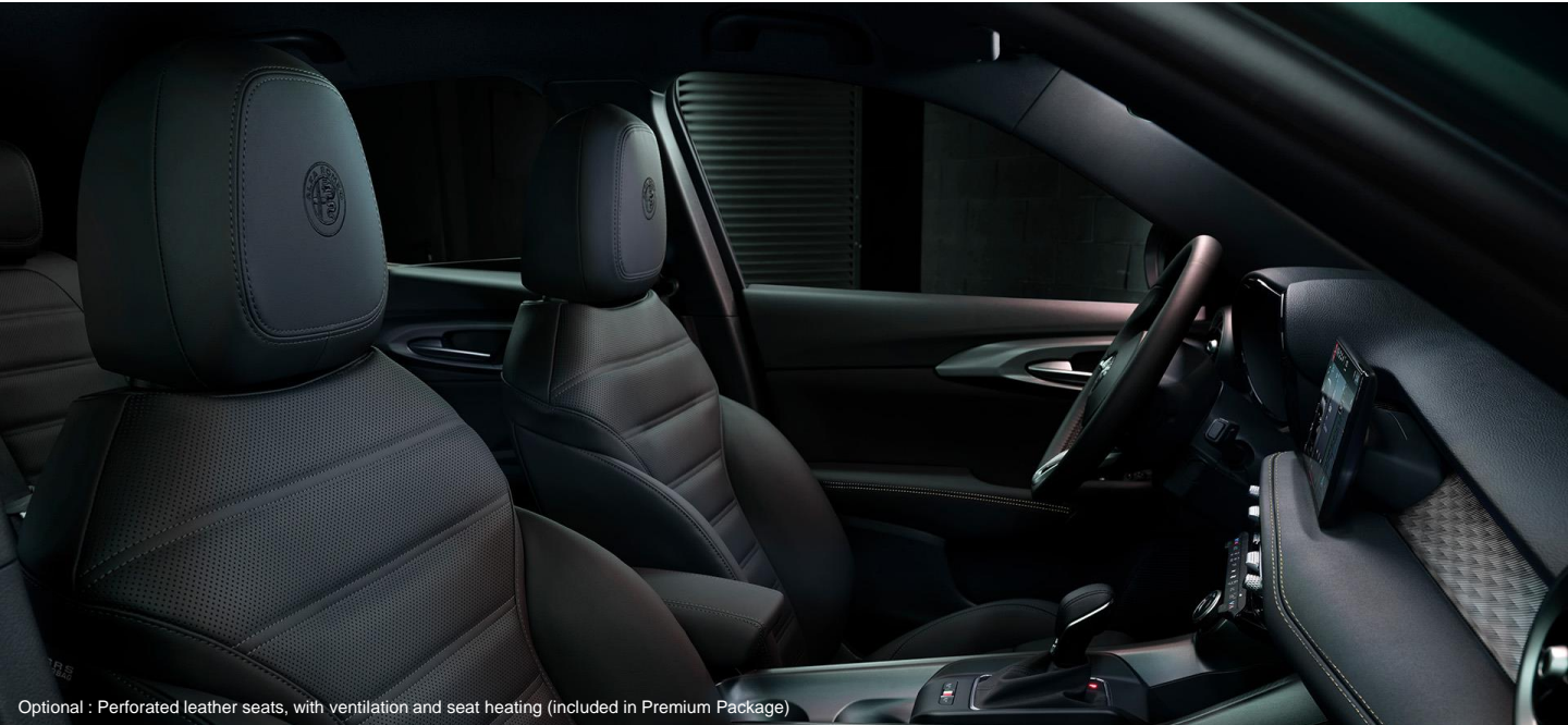
Optional : Perforated leather seats, with ventilation and seat heating (included in Premium Package)